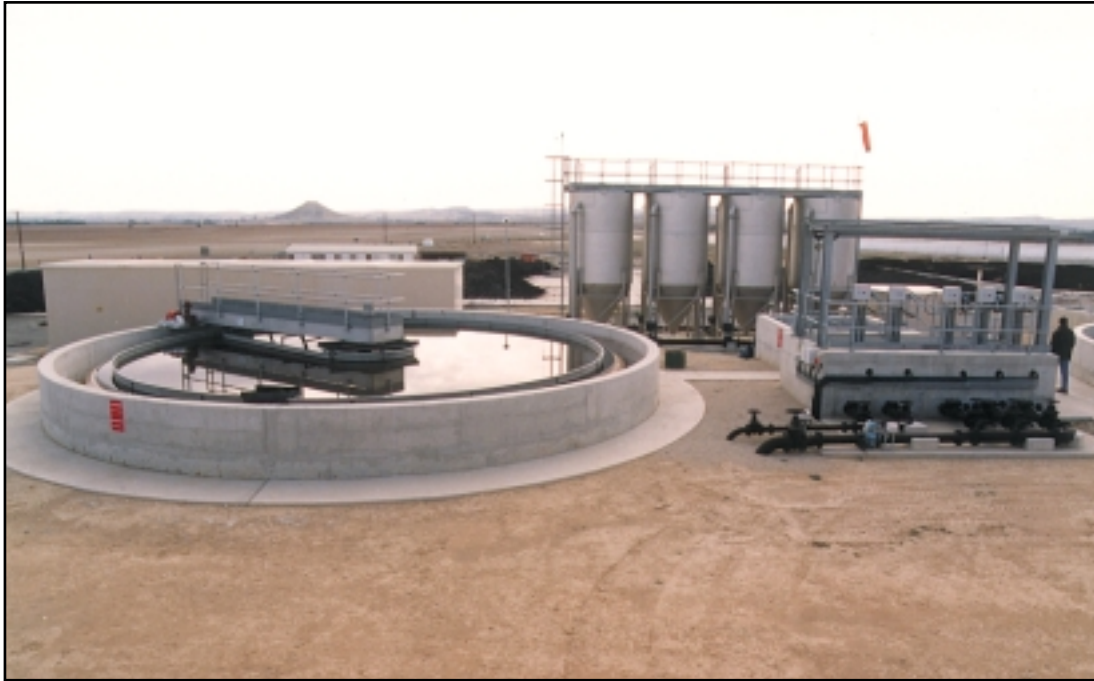
Secondary settlement tank and tertiary filters