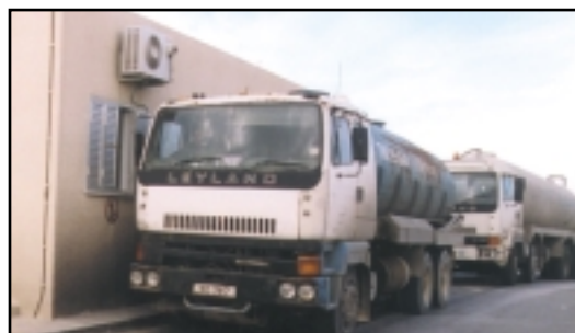
Tankers at the Reception Building

arrival, by the signal from its transponder, and is recorded in the computer in the reception building. After its recognition the tanker driver hands to the operator a completed copy of a docket on which the source of the waste or wastes is written.