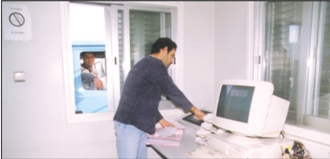
Reception Building - Registration of tankers for control and billing purposes

By entering the number of the docket into the computer, the source and category of the waste is validated and the computer allocates a discharge bay compatible with the pre-treatment that is required by the incoming waste.