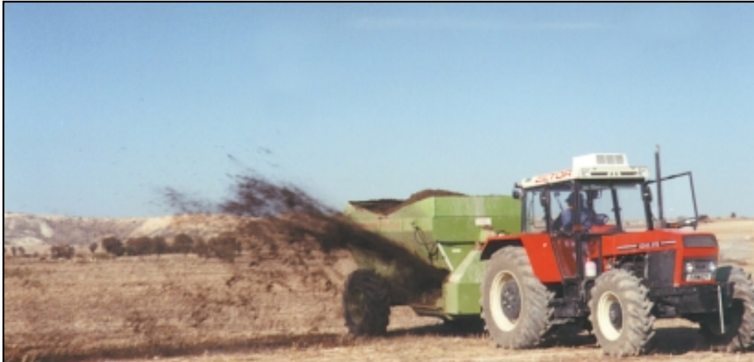
Land spreading of sludge