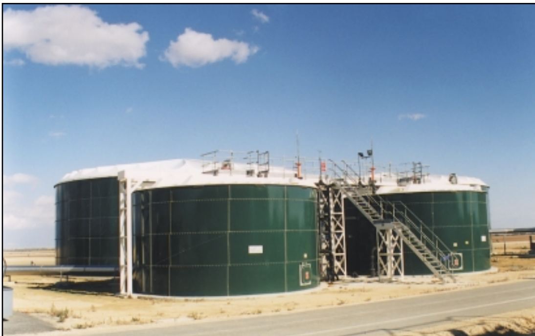
Sludge thickeners and aerobic digesters

The irrigation network covers approximately 50 hectares of land near Potamia and Geri villages for the irrigation of mainly fodder crops.