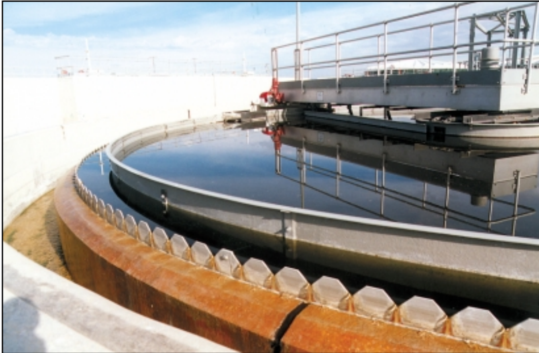
Secondary settlement tank