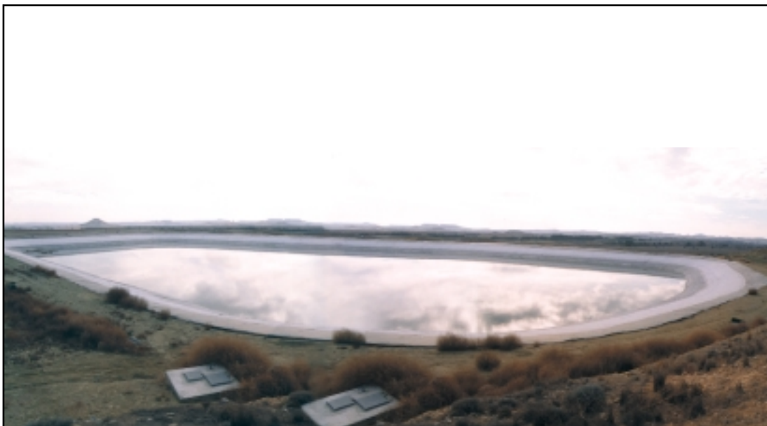
Recycled water storage lagoon

Apart from the control room in the administration building there are also the offices of the staff, the laboratory, a mess room for all the employees, a lecture room and a fully equipped workshop.