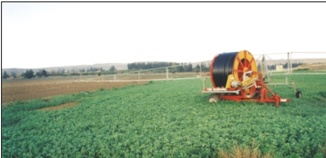
Irrigation with recycled water